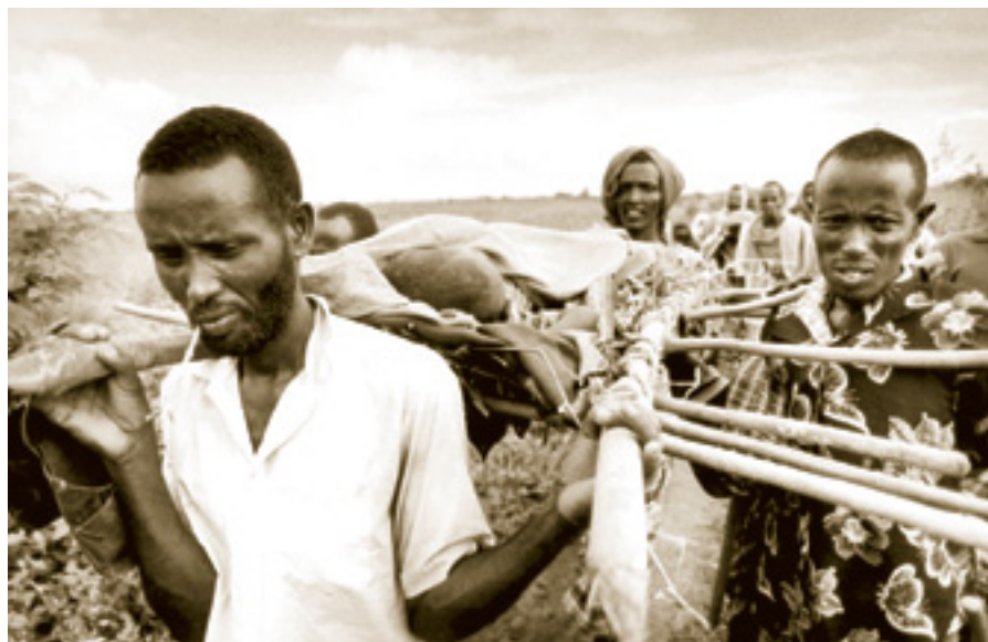
Villagers are forced to move by flooding in Somalia – cholera is endemic in the wet season so some members of the family have to be carried.

promotion of human capital. Distance and time increase the opportunity cost of accessing education and health care, and market imperfections resulting from transport deficiencies prevent access to medication, while poor water and sanitation increase health risks. 32 Preventable deaths become more likely, and human capital is depleted by ill-health and impairment.