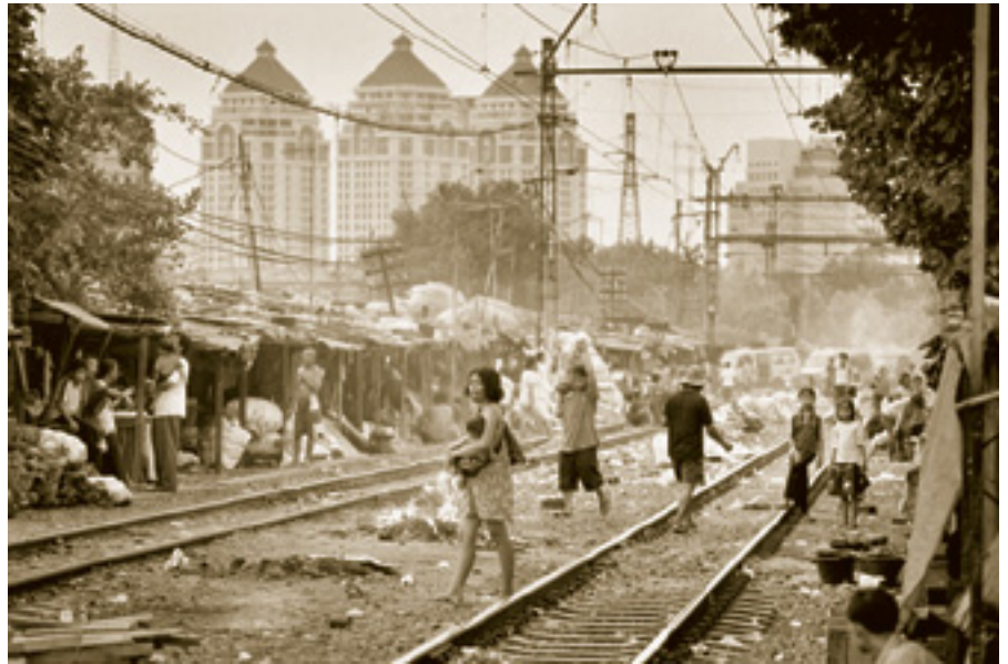
Marginal urban environments, like this railway track at Senen, Indonesia, are often home to chronically poor people.

Spatial poverty traps do not only occur in rural areas. In many countries there are urban and peri-urban poverty traps – Kibera in Nairobi, East Delhi, Soweto outside of Johannesburg are examples. Both rural and urban poverty traps are underpinned by a combination of location-specific factors and by the relationships they have (flows of people, labour, finance, resources) with other areas. A conceptual framework for analysing spatial poverty traps is outlined in Table 3.1. This identifies the social, economic, political and environmental factors that promote uneven development and lead to some areas having populations with high incidences of chronic poverty.